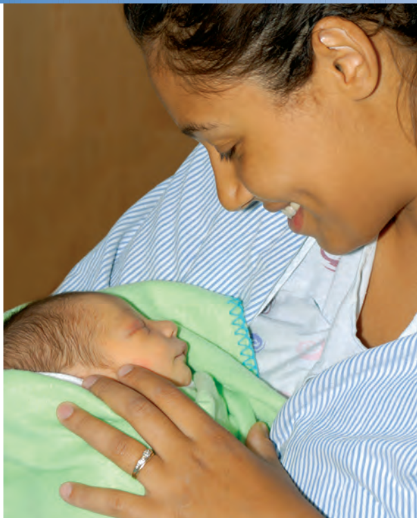
Bonding between a parent and child is important for a child's emotional and educational development.

Para Los Niños is honored to partner with First 5 LA and the families of Los Angeles to build healthy families. ✕