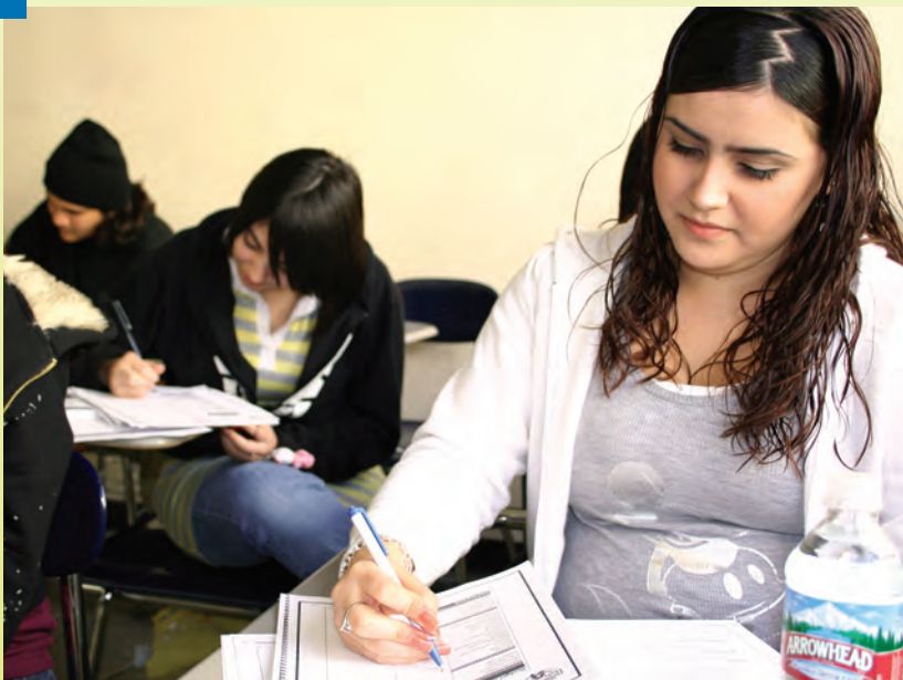
Participants practice balancing a checkbook in workbooks provided in the Financial First workshops.

There's a lot happening in Para Los Niños' programs for youth. From yoga and dance, to financial literacy and health education, Para Los Niños provides teens with a well-rounded experience to help them navigate through the difficult years of adolescence and beyond.