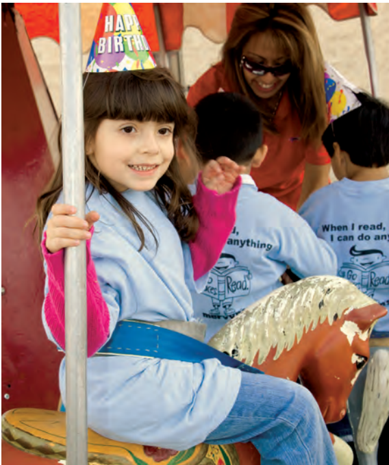
Children enjoy the festivities of the carnival-themed events.