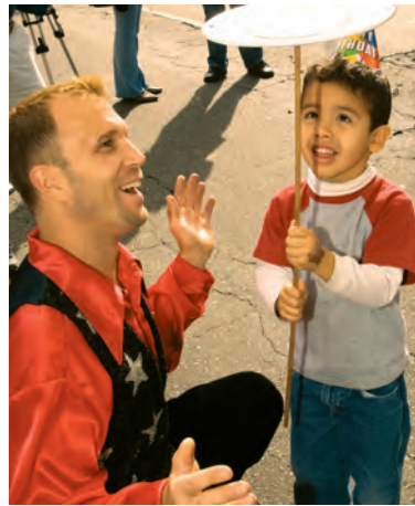
Clowns, games, a merry-go-round and plenty of treats were on hand for everyone to enjoy.