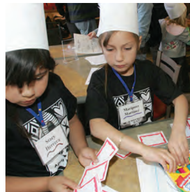
Students gathered at the Subway restaurant to prepare, decorate, and package lunches as part of National and Global Youth Service Day.