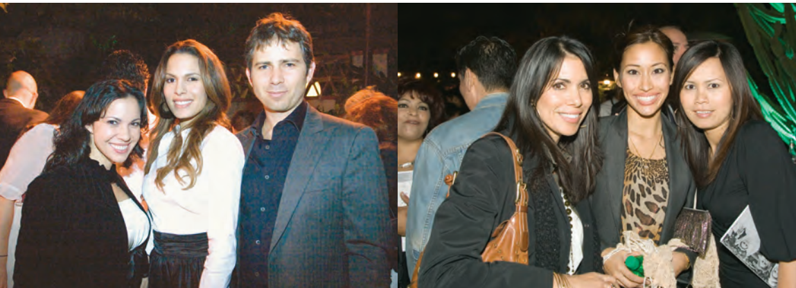
Honorary host, Nadine Velazquez of My Name is Earl enjoyed the evening with her husband and a friend.