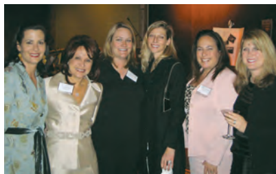
All smiles at the La Cañada Fundraiser.

The La Cañada Junior Women's Club (LAJWC) sure knows how to have a good time — and raise much needed funds! The group held their annual fundraiser on Friday, February 2, 2007 at Café Santorini in Pasadena. The evening included an elegant cocktail party, a silent auction, live auction, and plenty of merriment. Para Los Niños and Haven House were selected as the beneficiaries of the event. Many thanks to the members of the LAJWC for helping our children succeed!