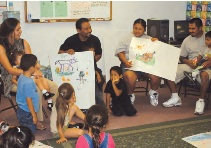
Young parents learn how to interact with their children in healthy and positive ways through parenting classes offered by Para Los Niños.