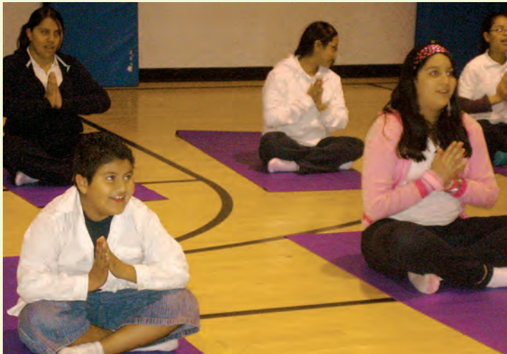
Teens get ready to breathe, stretch, and relax their stresses away.

Para Los Niños' Youth Center teamed up with the Eisner Pediatric & Family Medical Center's Hot Spots program to provide bi-weekly health classes, where the students learn about nutrition, fitness, and mental wellness.