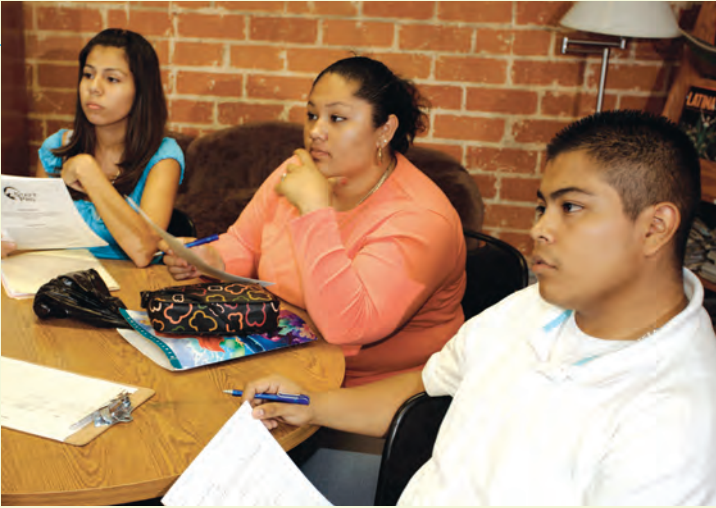
Students learn to incorporate healthy eating habits into their lifestyle.