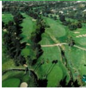
The beautiful golf course at the Wilshire Country Club in Los Angeles, site of this year's Fiesta Broadway Golf Tournament.