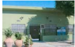
The new home of YDS and SAYS

These two programs moved their headquarters in September to a new facility in Leimert Park, the center of Los Angeles' historical African-American arts and cultural scene. The 3,850 square foot facility, which was recently renovated, is located at 4315-4317 Leimert Boulevard.