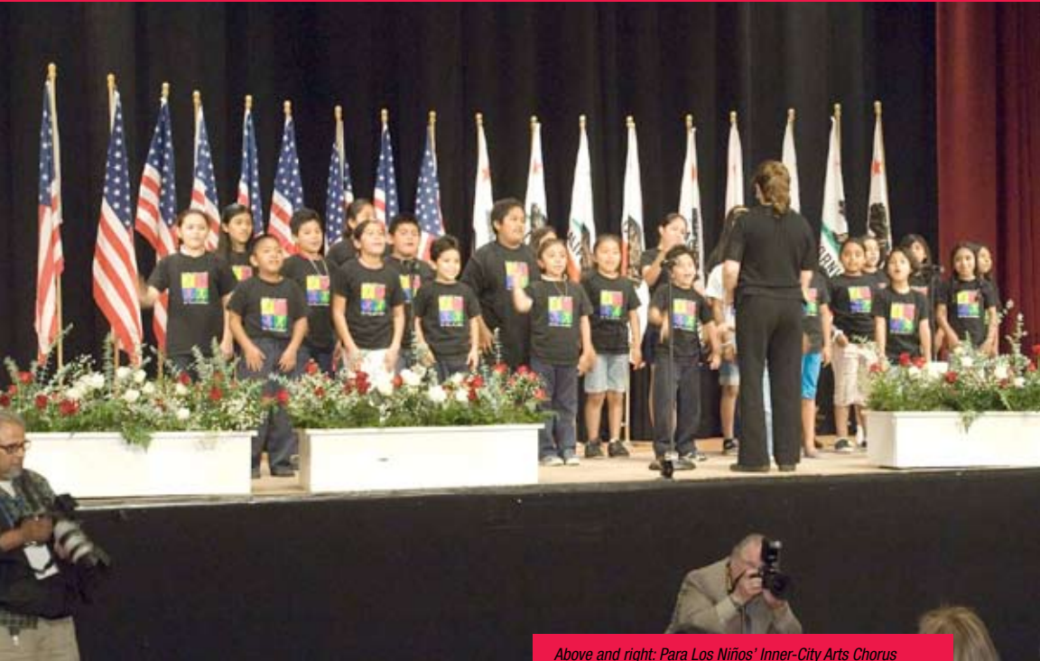
Above and right: Para Los Niños' Inner-City Arts Chorus performs at the swearing-in of Karen Bass as California Assembly Speaker.

T HE CHILDREN OF PARA LOS NIÑOS are enjoying the sweet sounds of music. Living in a city rich in arts and culture, Para Los Niños is fortunate to have recently collaborated with several arts organizations in Los Angeles to bring music to its educational programs. Para Los Niños has recently partnered with Inner-City Arts, Sound Art, the Los Angeles Philharmonic, and The Colburn School of Music.