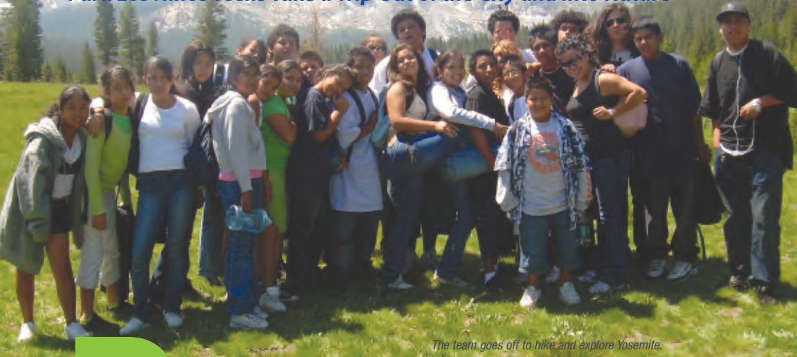
The team goes off to hike and explore Yosemite.

Para Los Niños Teens Take a Trip Out of the City and into Nature