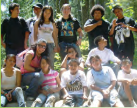
Teens smile amidst the Sequoias and sunlight.