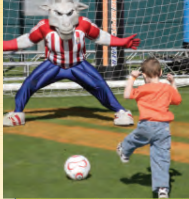
A young soccer fan shoots for a goal against the Chivas USA mascot.