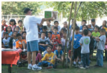
Nielsen Media volunteer engages the children in a favorite story.