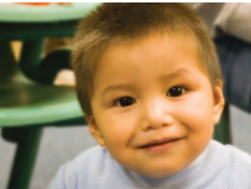
Learning at the Child Development Centers starts on day one.

The completion of this project is one of Para Los Niños' proudest moments and an historic milestone in our organization's history