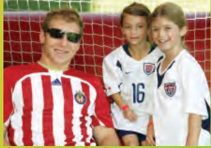
Chivas USA goalkeeper Brad Guzan poses with two of his biggest fans.