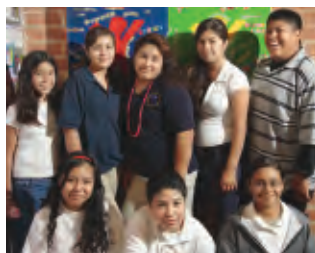
Participants learn about their options at the "I Can Afford College" workshop.