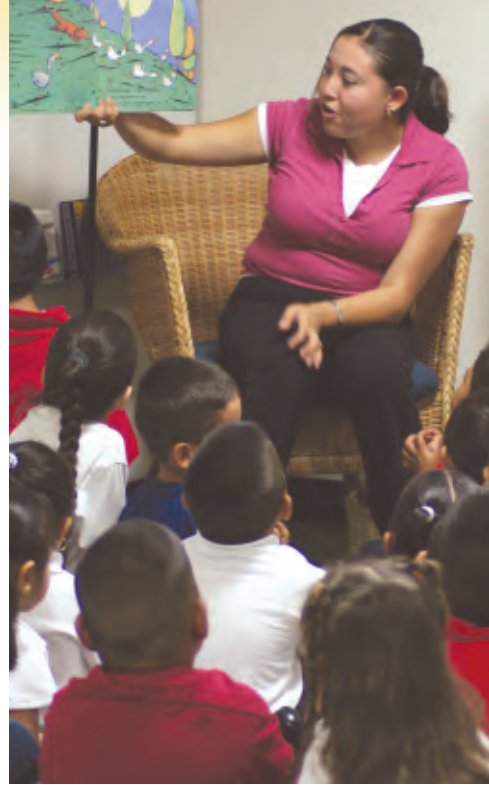
Students were eager to see their new classrooms and begin the school year.

In addition, all families have access to Para Los Niños' comprehensive family support services. Hard-working parents know that their children are receiving the highest-quality care for eleven full hours a day. This generous schedule allows parents to work or attend school, and ensures that children are not left alone in the crucial after-school hours. In addition, all children receive — free of charge — breakfast and lunch on the school campus.