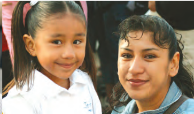
Parents and children alike were happy to see the Family Learning Complex open.