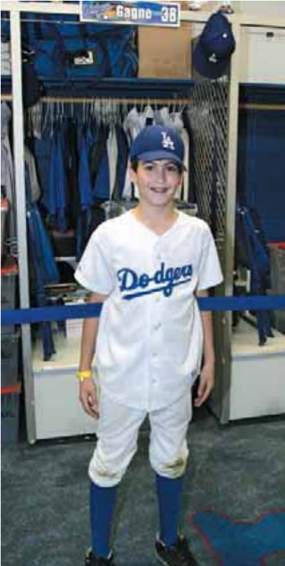
Dodger fan gets an inside peek of Eric Gagne's locker.

More than $300,000 Raised to Support Para Los Niños