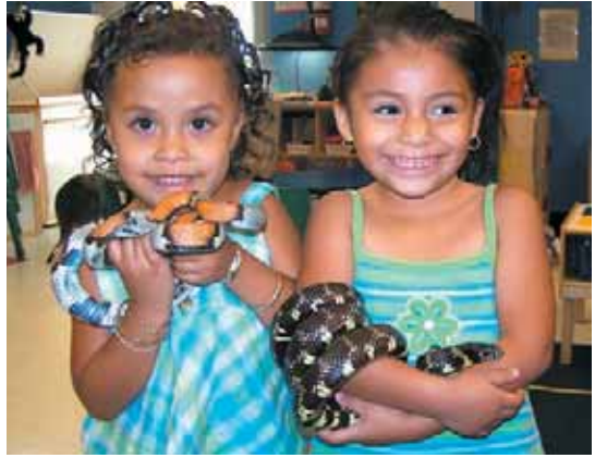
Two preschoolers learn that reptiles are nice!