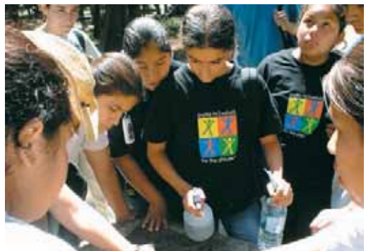
Students learn how to read topography maps.