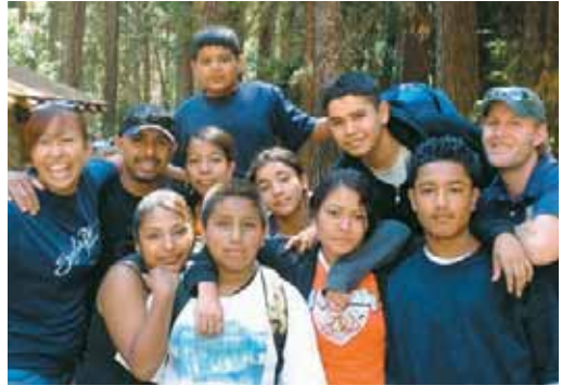
Youth Center teens and staff stop for a quick pose before an early morning hike.

For these gifts, Para Los Niños would like to thank The Capital Group, the American Funds Department, and the Yosemite Institute for their continued support of this extraordinary program.