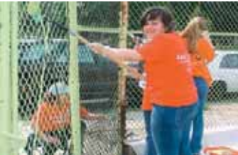
Community service projects were also on the agenda during the Philadelphia visit.