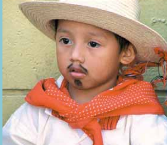
A serious moment during the Celebrando Nuestras Culturas event, honoring Para Los Niños' families' cultures.

Children and their parents participated in an array of activities designed to celebrate their cultural legacies. Parents created costumes for their children, which were proudly worn to the celebration. During the event, children made necklaces and bracelets, listened to story-tellers, and recorded their family stories in journals.