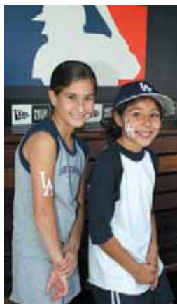
Dodger fans strike a pose in the visitor's dugout.